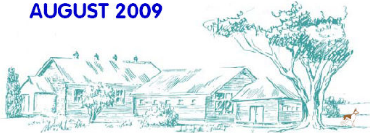
The Bass Valley News is a FREE publication provided for you by the Bass Valley Community Centre.